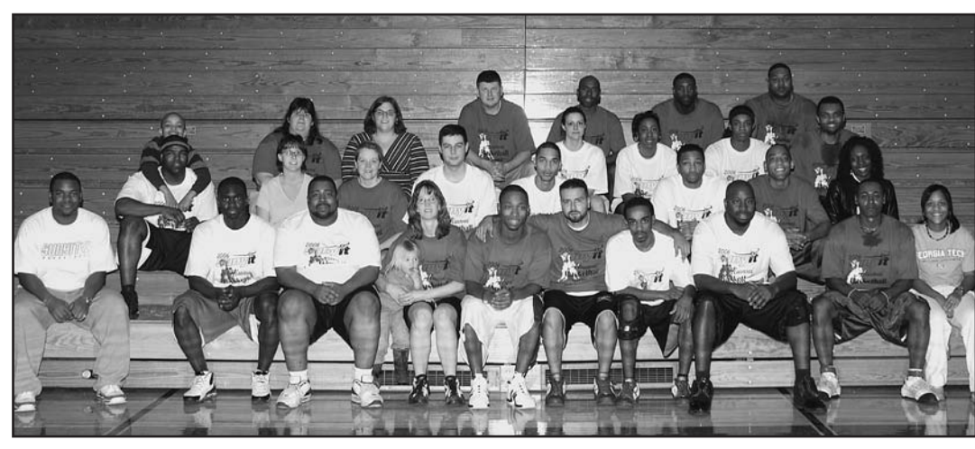
Among Alumni Association expenditures for events, 14.3% went to support Athletics over the past 12 months, which included sponsorship of the pizza party following the Alumni Basketball Game on Jan. 28. Shown here are alumni who participated in the game.

The Alumni Association is working to make the next 12 months even better (see Upcoming Events on page 5). Alumni and future alumni who want to learn more can visit www. sunyit.edu/alumni or contact the Alumni & Parent Relations Office at alumni@sunyit.edu or (315) 792-7110.